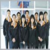
南京物流中心核心团队