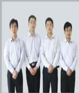
网购物流部核心团队