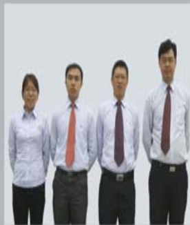
西部业务部核心团队